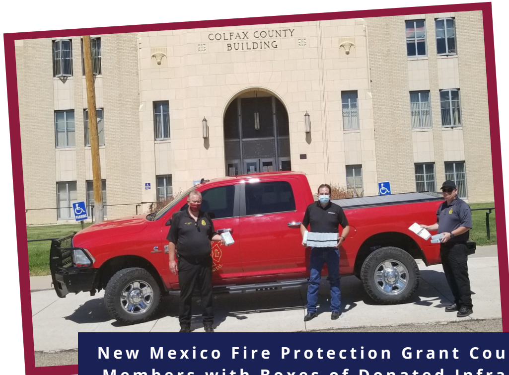
New Mexico Fire Protection Grant Council Members with Boxes of Donated Infrared Thermometers

In Summer 2020, the Fire Family Foundation donated 500 infrared thermometers to firefighters in New Mexico, in partnership with the New Mexico Fire Protection Grant Council.